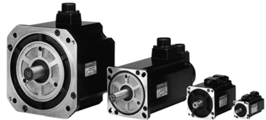
Fig.1 “Q” Series AC Servomotor

Fig.1 shows a picture of various “Q” series AC servo motors. Table 2 shows the basic specifications of the motor. All models have a sealed frame where O-rings are used to improve the waterproof performance.